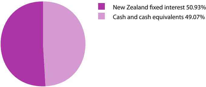
Actual Investment Mix